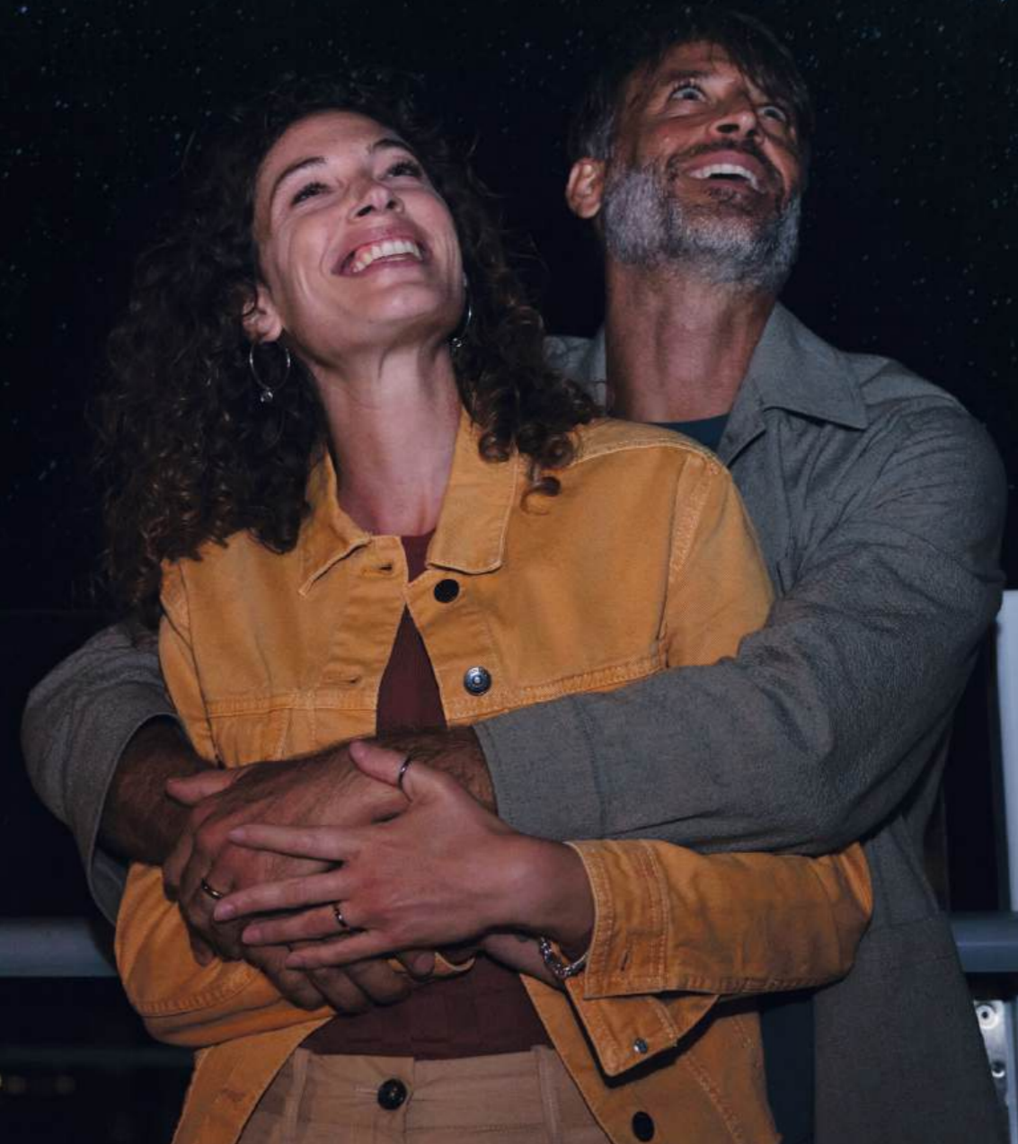
— Canary Sea Darkest Spot

Then, at the Canary Sea Darkest Spot , the night turns into pure wonder, as the ship's lights fade and constellations, planets and galaxies appear above the open sea.